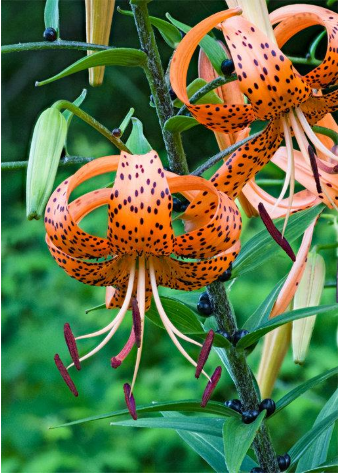
The glorious Tiger Lily.