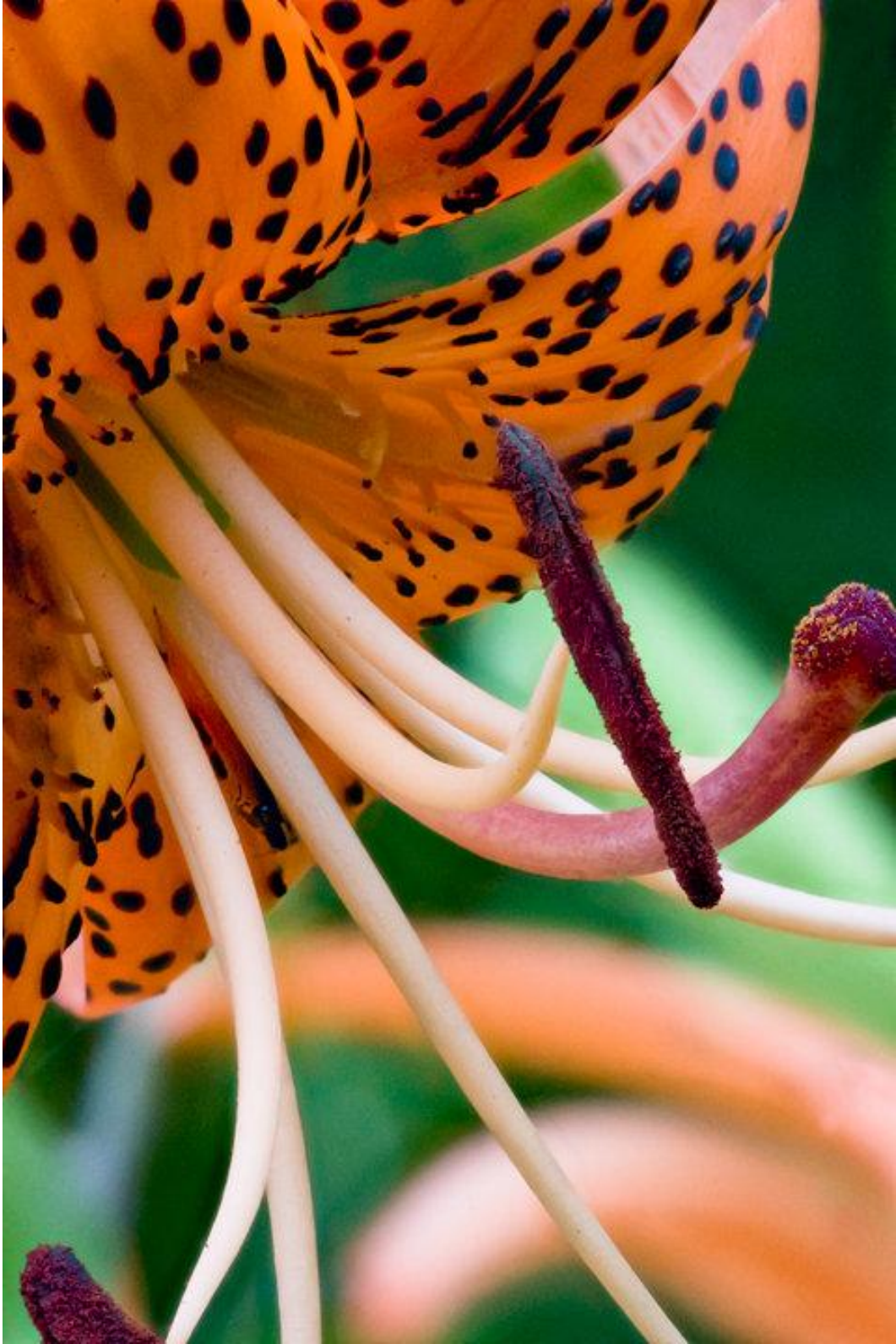
Tiger Lily, what a gorgeous flower!