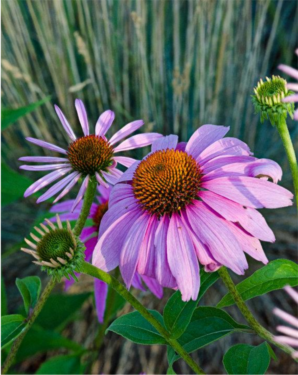
Echinacea, my old friend in winter.